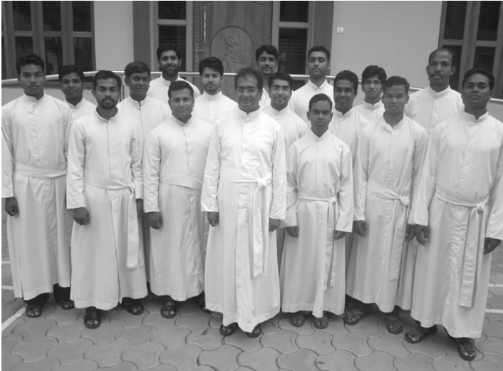
Scholastics' get-together of CMI Nirmal Province Jagdalpur was held on 19 th May 2014, at Nirmal Sadan Provincial House,